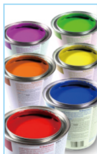
Paint & Ink